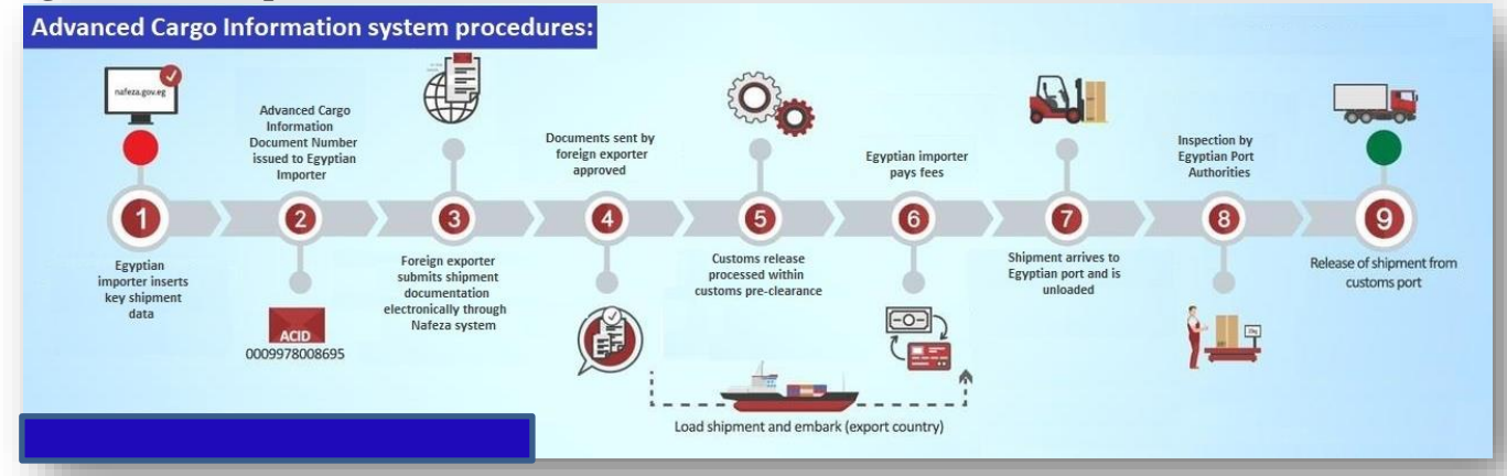
Figure 1: Pre-shipment Process Procedure